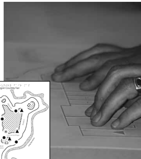
Above: Reading a tactile map at the country fair.

conference hotel and the rooms in which different talks and events took place. The second map was of the surrounding area and includes the MAX light-rail tracks and stations and the mall and its entrances. SMRCL is currently collaborating with Guide Dogs for the Blind to update the maps of their dormitory, school grounds, and areas of downtown Gresham where they train on the campus in Boring, Oregon. Amy Lobben and Megan Lawrence were instrumental in creating these maps and communicating with the community at large.