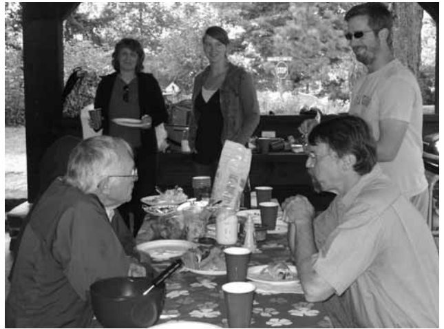
Members of the Lane County Geographical Society enjoying good conversation and food at the annual picnic.

T he Lane County Geographical Society (LCGS) held its annual picnic and business meeting this year on September 28 at Hendricks Park. Attendance was not as high as in previous years, likely due to classes starting the very next day, but we did have people from outside the Department of Geography attend the picnic. This year the picnic will be moved to late May to allow more people to attend the event. LCGS