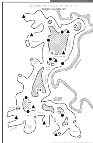
Left: The tactile map of the Oregon Country Fair created by the Spatial and Map Cognition Research Lab.