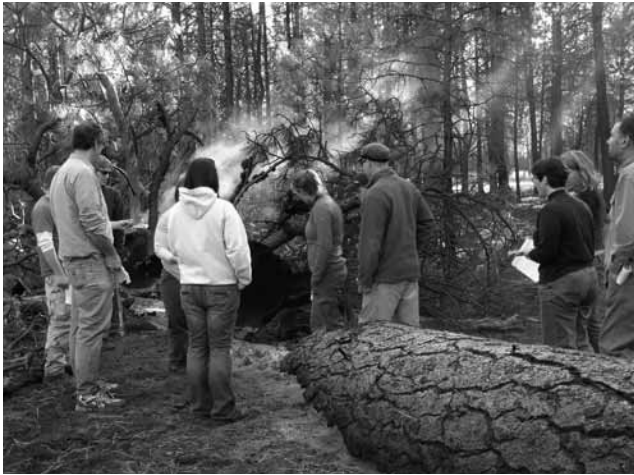
Fire in the Environment field trip to the B&B Complex fire in Santiam Pass and to the smoking remnants of a prescribed burn in Sisters, Oregon.